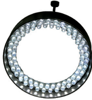
MILX-30-070-WP (PURE WHITE)

Application: LED illumination On Stereo microscope system