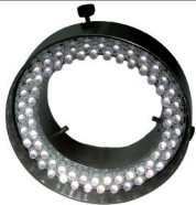
MILX-30-070-WD (WARM WHITE)