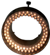
MILX-30-070-WF (WARM WHITE)