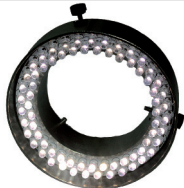
MILX-30-070-WE (WARM WHITE)