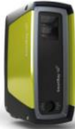
SmartRay™ ECCO 75.200