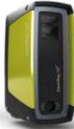
SmartRay™ ECCO 75.100