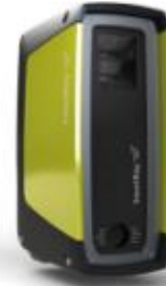
SmartRay™ ECCO 75.030